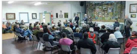
Telstra Meets the Deans Marsh community August 20 2014.