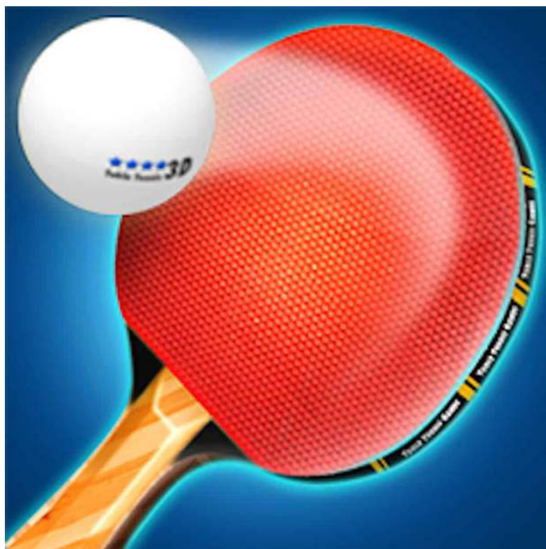
Table tennis in the Hall every Tuesday night 1